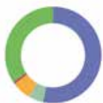
Participants AIMS 2018 by Sectors

Each year, our Conference hosts more than 200 professionals from academic institutions, government agencies, equipment suppliers, software providers, professionals from the mining industry and practitioners from consulting companies.